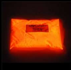
Red Short Luminance Solvent only