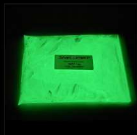
Vert High luminance Solvent or Waterbased All particle sizes

Definition: The name phosphorescent covers in general all types of pigments that emit light thanks to a luminous excitement. We will then talk about phosphorescent pigments to be more precise.