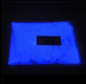
Bleu Low Luminance Solvent or Waterbased