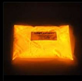
Orange Low Luminance Solvent only