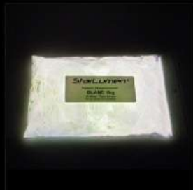
White Low Luminance Solvent only