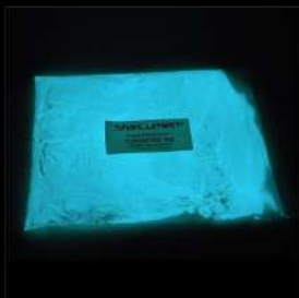
Turquoise (Blue-Green) Good luminance Solvent or waterbased